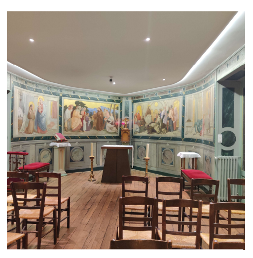
The Oratory Presbytery of Saint-Augustin Church where Father Caffarel lived from 1940 to 1979