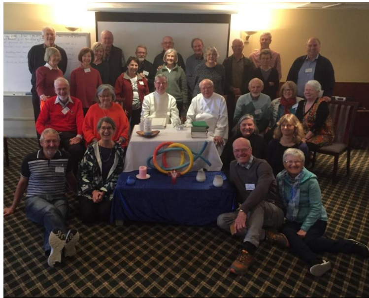
Snapshots from the October '22 Retreat