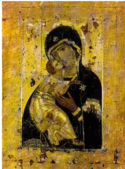
Virgin of Kyiv 12 th Century Icon from Ukraine

Warm greetings, blessings and best wishes to all in the Oceania and global Equipes Notre Dame family. We reach out through this newsletter to nurture treasured relationships, share recent news from throughout the Super Region and inform you of upcoming events in 2023 and 2024 that we hope will be exciting and of interest to you.