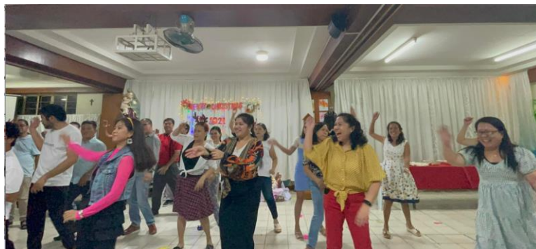
Cebu Teams fun at Christmas Time